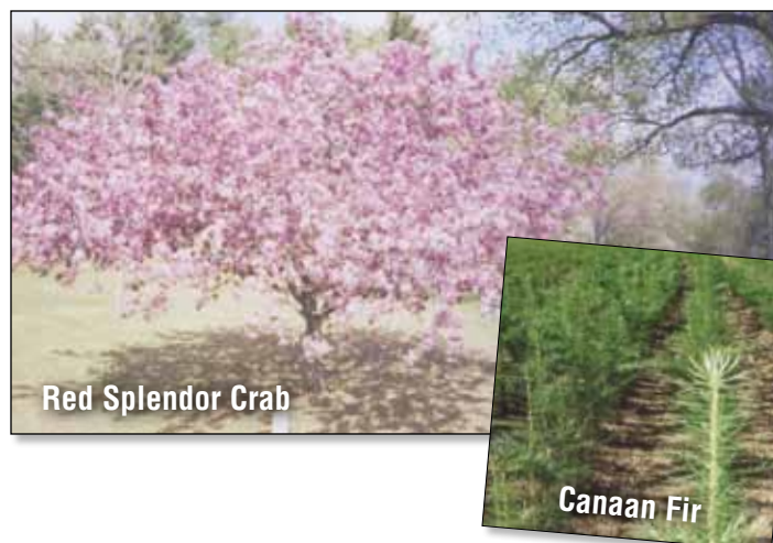
Red Splendor Crab

12-18" 2 YR. S. .... (25's) $170.00 $775.00