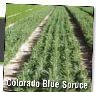
Colorado Blue Spruce

CHECK US OUT ON THE WEB WWW.LAURASLANENURSEY.COM