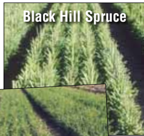
Black Hill Spruce